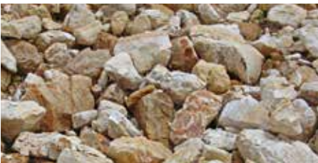
Sizing 100 x 200mm suitable for landscaping/garden ground cover/gabion cages (Code: Z1-NS100x200)