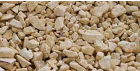
Sizing 65mm x 100mm, suitable for landscaping/garden ground cover (Code: Z1-NS65x100)