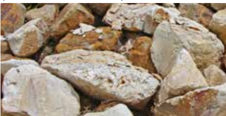
Sizing 200mm plus, suitable for landscaping/garden ground cover/gabion cages (Code: Z1-NS200)