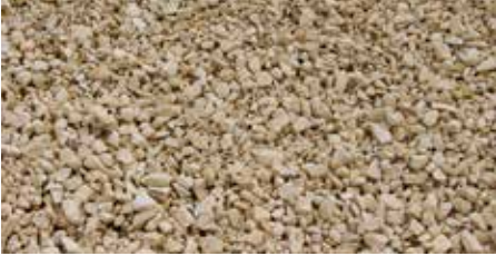
Sizing 25mm x 65mm, suitable for landscaping/garden ground cover (Code: Z1-NS25x65)